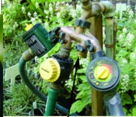
4 outlet combo